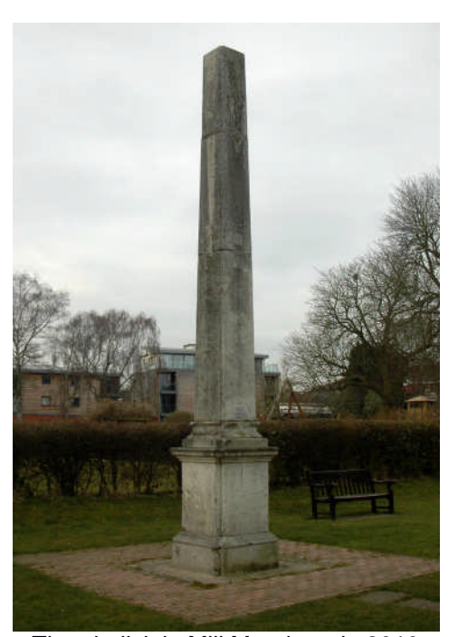
The obelisk in Mill Meadows in 2010

The obelisk was eventually relocated to Mill Meadows, where it can be seen today.