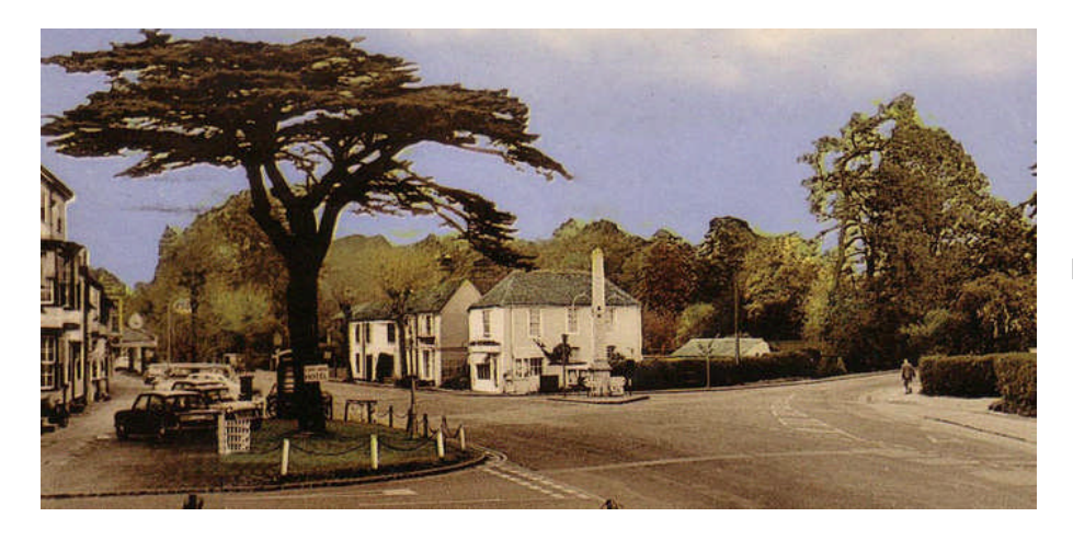
The obelisk at the Marlow Road junction in 1967

The obelisk was eventually relocated to Mill Meadows, where it can be seen today.